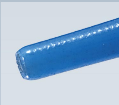
Molded atraumatic soft tip.