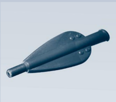
Ergonomic hub design with integrated guidewire click system.