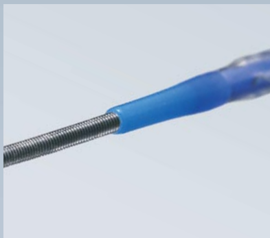
Tapered minimized lesion entry profile.