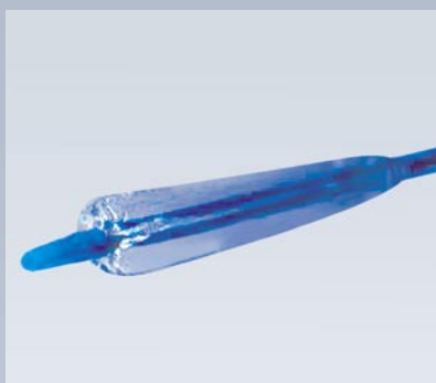
Tri-fold balloon wrap